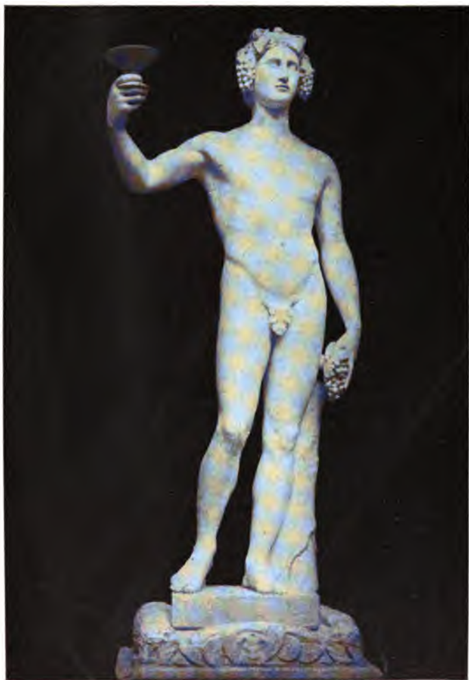
Fig. 46. Dionysus or Bacchus.